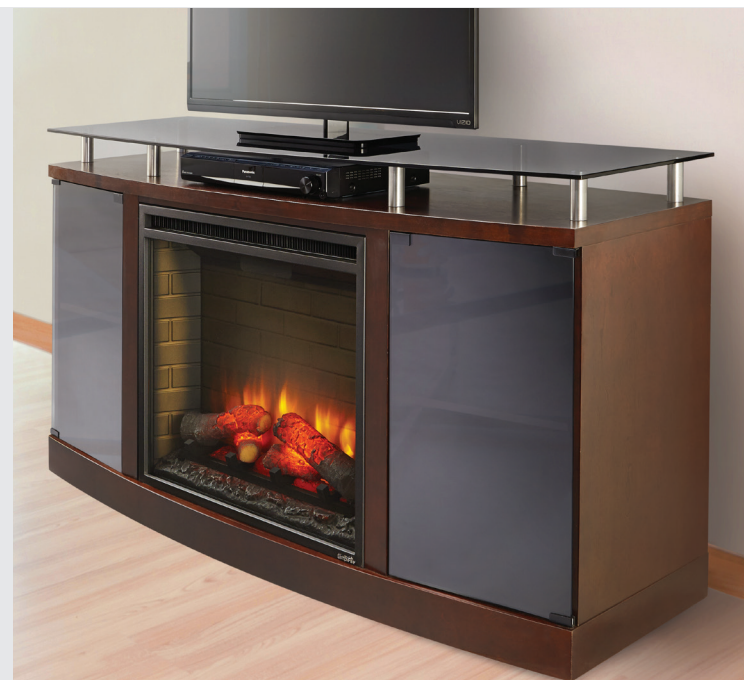
Above: Venture Media Cabinet